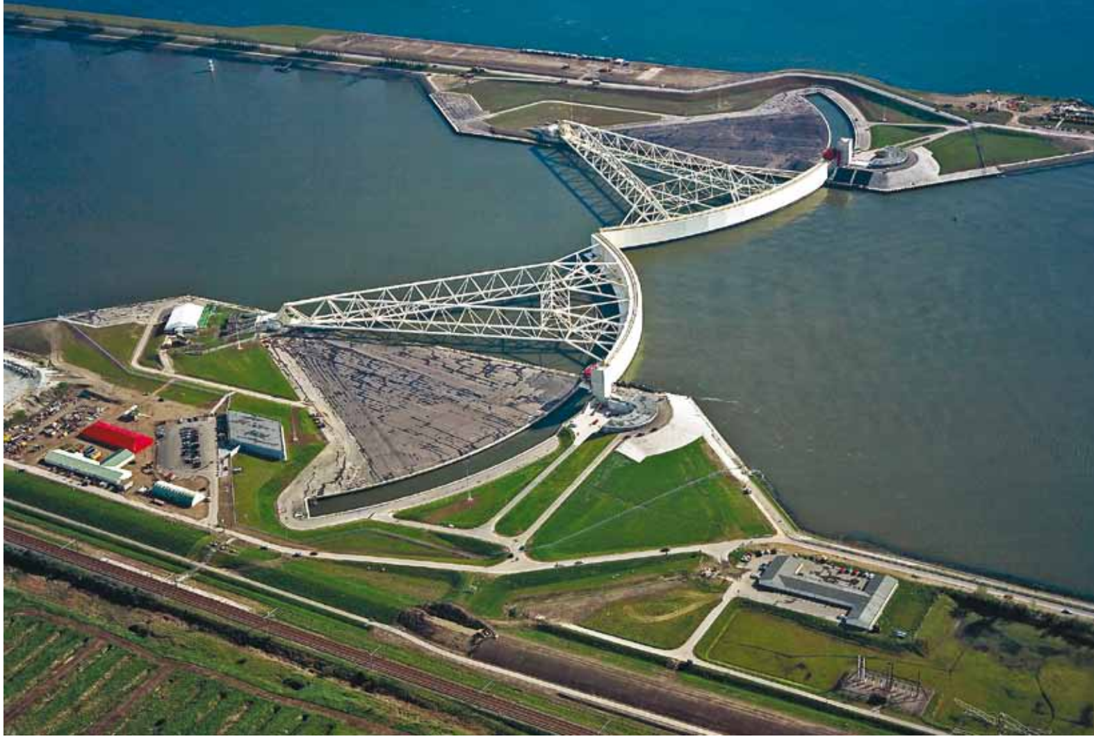
In combination with dunes and levees, the Maeslantkering is crucial to flood management in Rotterdam

One particular aim is to devise measures that will benefit several themes, and that allow for a combination of functions, for instance. Examples include innovative primary water defences in an urban context; levees that offer both protection and room for residential or recreational purposes. Yet another example concerns the installation of flexible flood defences with a lock-off valve to secure the Rijnmond region in times of heavy storms, while at the same time boosting the economic development of the areas outside the levees.