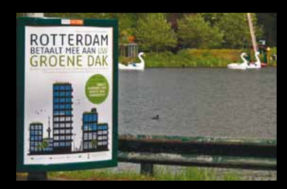
Rotterdam green roofs campaign