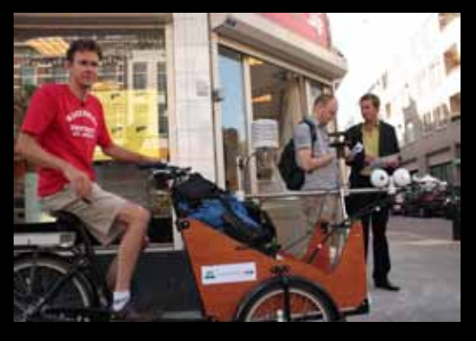
Recordings in New York for the '010 Water' television series / The first heat stress measurement in August 2009 resulted in a lot of attention from the media